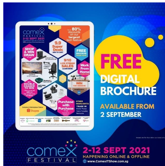
Free COMEX digital brochure

The highly anticipated festival will be co-presented with leading e-commerce platform Shopee. Exclusive COMEX-Shopee partners such as Samsung, LG, Armgaddeon and Gigabyte will be offering up to 80% off consumer electronics products and 9.9 hot deals where consumers can shop online and offline islandwide during the September school holidays.