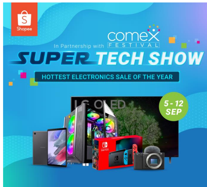
Hottest Deals at the Super Tech Show

Consumers can stay tuned for the $0.10 Mega Surprises for a chance to win attractive electronic products such as the Realme C25s mobile phone and Nintendo Switch Lite at only $0.10 from 9 September. In addition to shopping for 100% authentic products from brands like Samsung, TP-Link, LG and Gamebusted, consumers can also enjoy 1-for-1 deals, under $0.99 deals and much more!