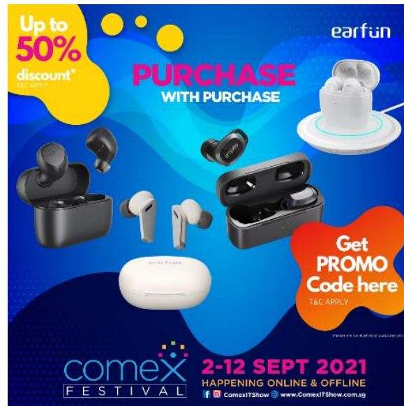
Earfun Purchase with Purchase (PwP) deals

In addition, American Express (AMEX) card holders can look out for an exclusive month-long contest held from 1 – 30 September 2021 where one lucky entrant will win an Omnidesk Wildwood+ series desk with personalized name engraving. Sign up for an AMEX card from 1 - 30 September 2021 and receive $180 worth of CapitaVouchers when you apply with min. spending of $500 within the first month. Also, earn 3% Cashback on your first S$5,000 spend within the first 6 months (T&C apply).