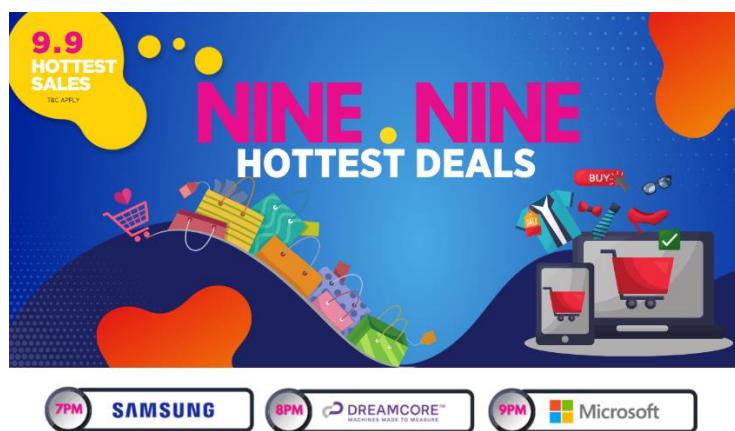
COMEX 9/9 Super Deals and Livestream

Livestream shows will be making their appearance for the first time during the COMEX Festival 2021, with a 9.9 live show to be held on the COMEX Facebook page from 7 – 10pm featuring fantastic offers, promotions and live demonstration sessions from Microsoft, Dreamcore, Samsung and a giveaway from PaperOne. Consumers can also keep their eyes peeled for a list of 9.9 super deals that will be featured on a special page on the COMEX website .