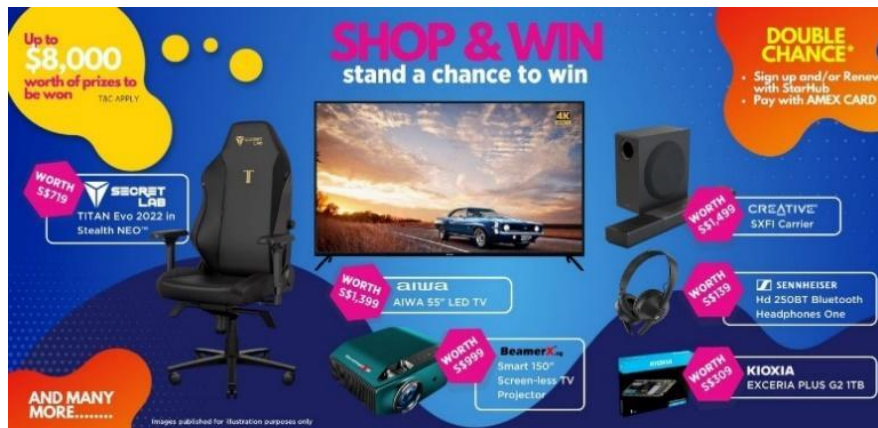
Shop and win lucky draw prizes

Shoppers at the COMEX Festival 2021 will be excited to know that the shop and win lucky draw is making a comeback, featuring up to $8,000 worth of prizes to be won – with double chances for AMEX card holders and StarHub users. The prizes up for grabs include a Secretlab TITAN Evo 2022 in Stealth NEO™ Hybrid Leatherette gaming chair, AIWA 55" inch LED TV, Creative SXFI Carrier Soundbar, BeamerX Smart 150" Screenless TV Projector and more.